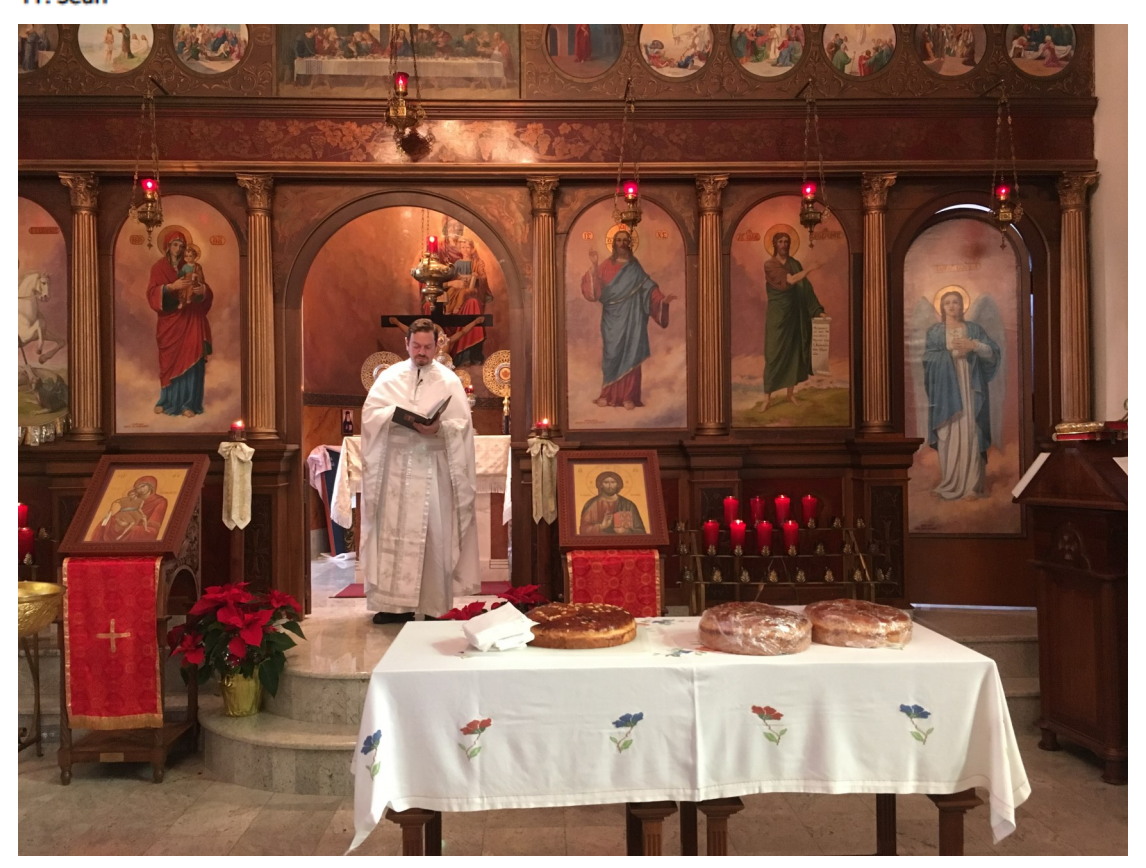
Vasilopita Celebration 2017