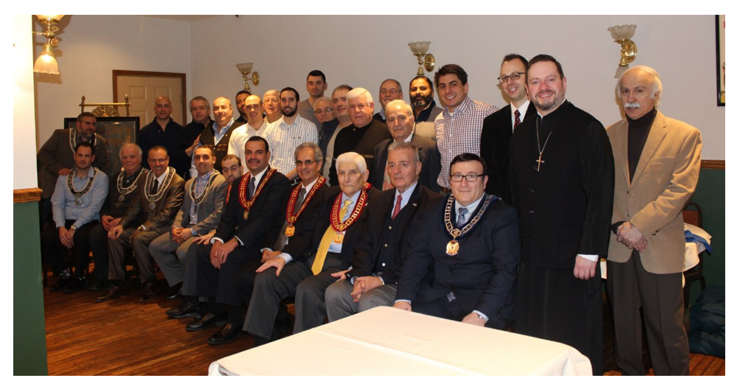
Saint George Greek Orthodox Church welcomes the newly reactivated AHEPA Chapter # 125.