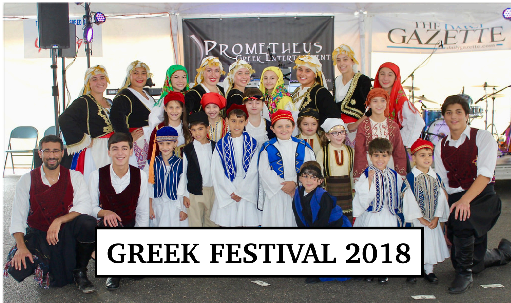
GREEK FESTIVAL 2018

107 Clinton St. Schenectady, NY 12305 (office) 518.393.0742 (fax) 518.393.4093 Office Hours: M-TH 9-2 www.saintgeorgegoc.com