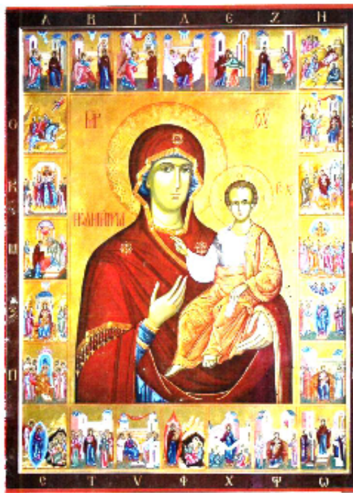
ICON OF THE LITURGICAL OF THE AKATHIST HYMN